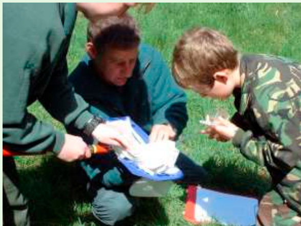
A young ranger insect identifying at High Lodge

After the Conservation groups' activities being curtailed in 2001, we moved to meeting 6 times this year, working at High Lodge, Mildenhall, Santon, and two visits to Hills and Holes.