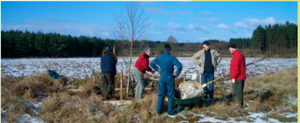
2005 – Conservation Group putting in tress around the wildlife ponds on the Goshawk Trail.