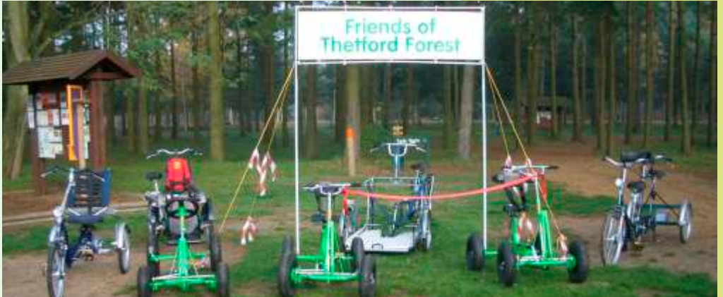
2004 – The Friends launch the all-ability cycles at High Lodge