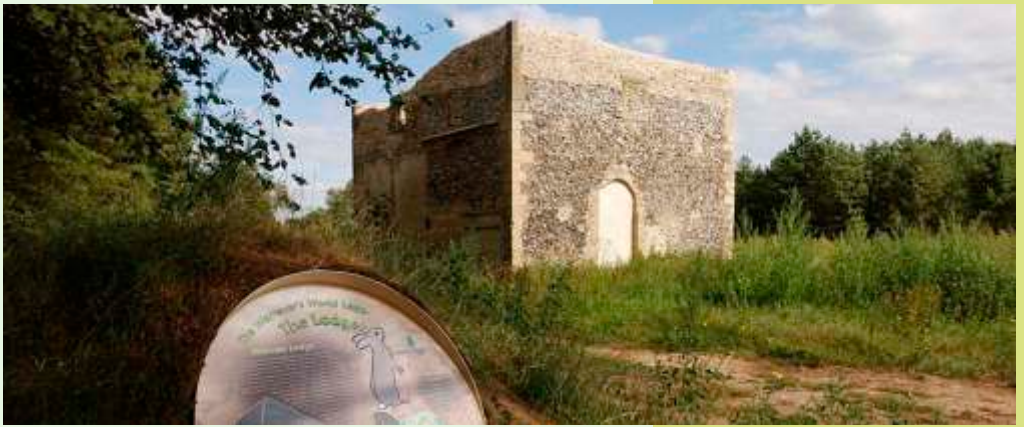
2003 - Mildenhall Warren Lodge restoration works completed and the walking trail is opened.