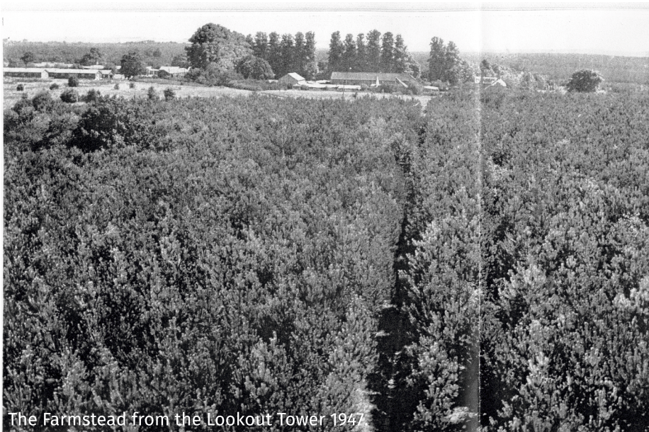
The Farmstead from the Lookout Tower 1947

In the second photo, taken in 1947 from the nearby lookout fire tower, you can see the farmstead buildings and just glimpse the gable end of the farmhouse.