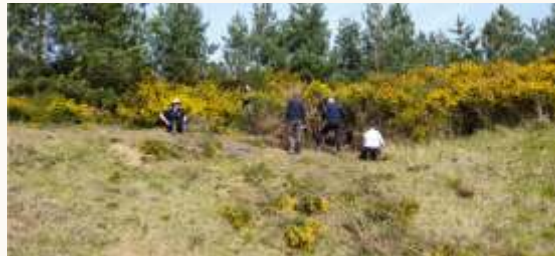
April Mildenhall Warren pits