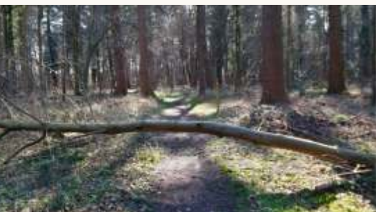
Fallen tree over footpath, need reporting as too large to move to one side