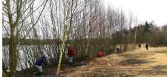
February Lynford water