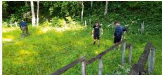
June Rex Graham Reserve