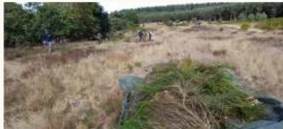
August Santon Street