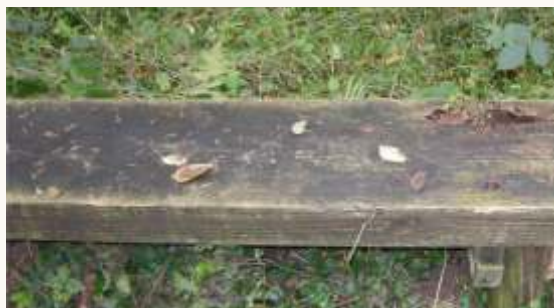
Rotten wood on bench seat, needs reporting as unsafe