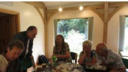
Sorting and labelling archaeology finds

Below are 7 images to give some idea of things that may come up while taking part in the archaeological activities, or working in the arboretum, and small but important things on a trail check for everyone’s safety.