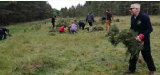
May Kings Forest