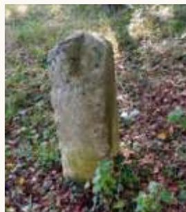
Finding an old boundary post to report