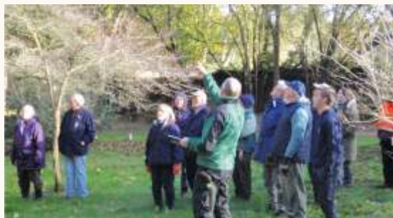
Learning how to identify and label trees in the arboretum