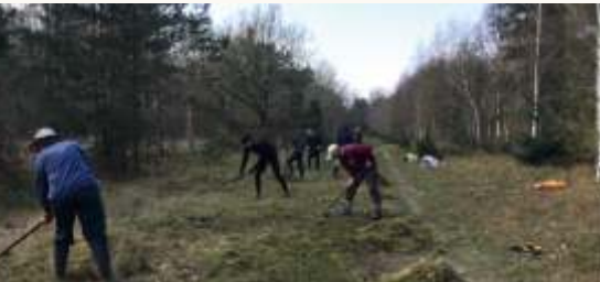
March Mildenhall Woods