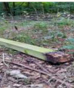
Broken marker post to report