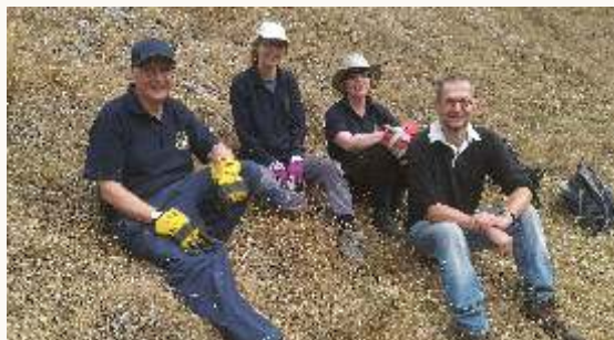
Having cleared brash from a bank at St. Helens Well, a moment's rest