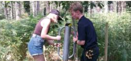
July Lynford Arboretum