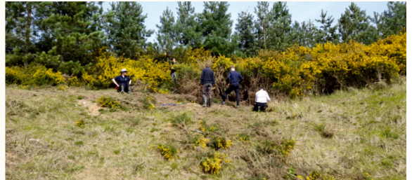
April Mildenhall Warren pits