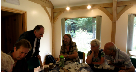
Sorting and labelling archaeology finds

Below are 7 images to give some idea of things that may come up while taking part in the archaeological activities, or working in the arboretum, and small but important things on a trail check for everyone's safety.