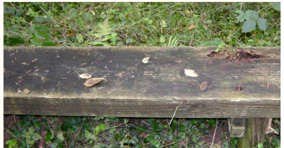
Rotten wood on bench seat, needs reporting as unsafe