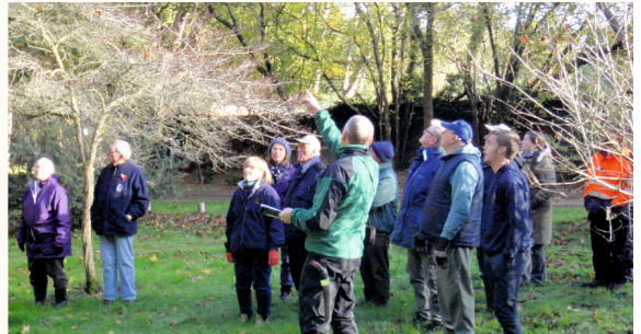
Learning how to identify and label trees in the arboretum