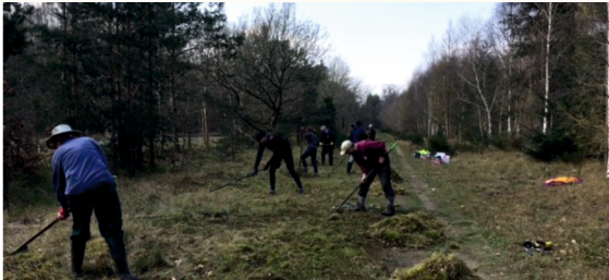
March Mildenhall Woods