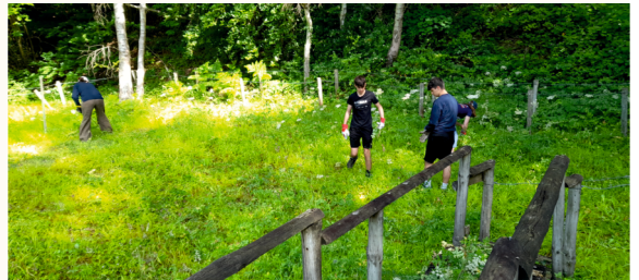
June Rex Graham Reserve