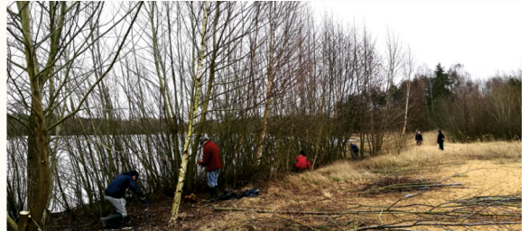
February Lynford water