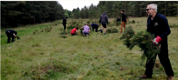
May Kings Forest