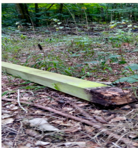
Broken marker post to report