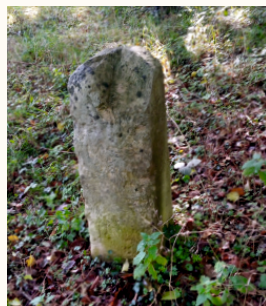
Finding an old boundary post