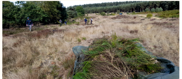
August Santon Street