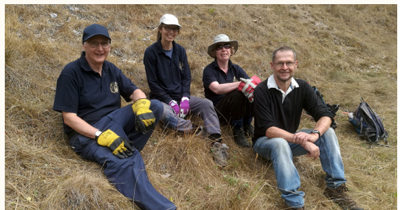
Having cleared brash from a bank at St. Helens Well, a moment's rest