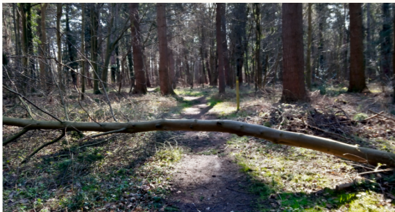
Fallen tree over footpath, need reporting as too large to move to one side